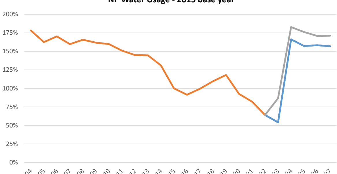
Figure 1. Historic (orange), Predicted (blue) and Risk (grey) NP Water Usage - 2015 base year

We continue to work closely with our customers to promote water efficiency and with our bulk supplier to facilitate good operational supply management and planning for industrial growth.